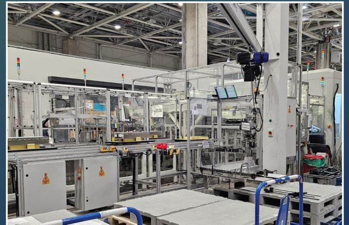
Sample Production Line